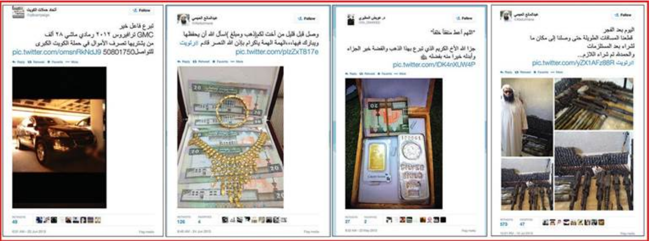
Donations to ISIS Publicized on Twitter