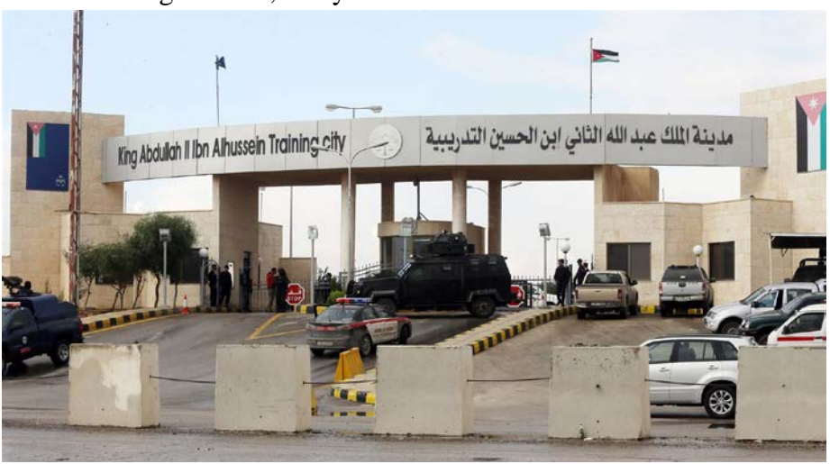
Entrance to the International Police Training Center in Amman, Jordan

Virginia Beach Policy Academy, a former police officer in the Virginia Police Department and had trained police officers in Afghanistan, Kenya and other locations.