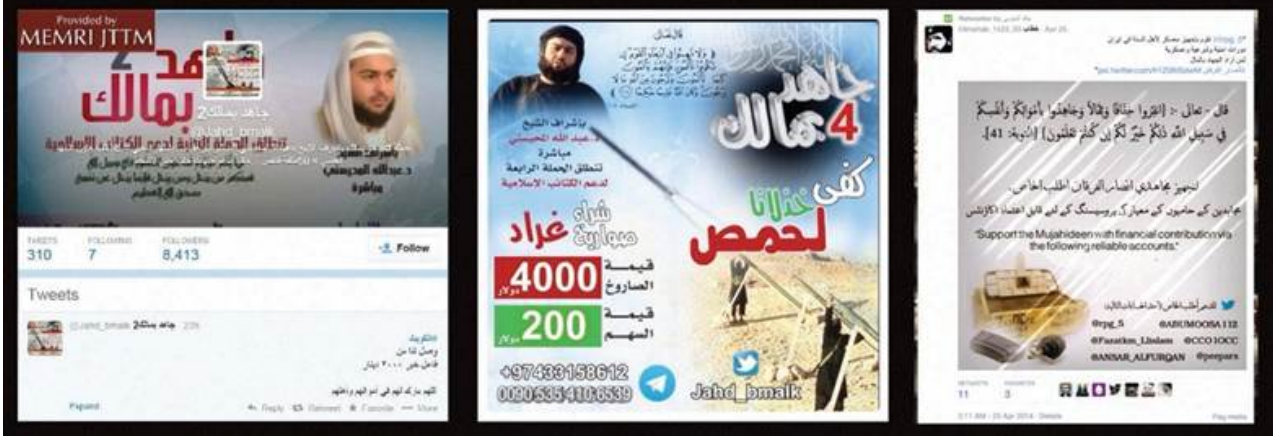
Fundraising Images from ISIS Twitter Accounts

The account tweeted that "if 50 dinars is donated, equivalent to 50 sniper rounds, one will receive a 'silver status.' Likewise, if 100 dinars is donated, which buys eight mortar rounds, the contributor will earn the title of 'gold status donor.'" According to various tweets from the account, over 26,000 Saudi Riyals (almost $7,000) were donated.